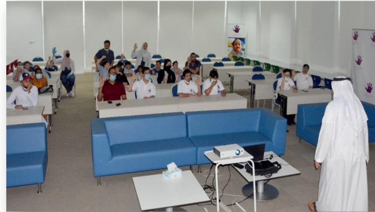
Educational Awareness Workshop about the culture of conservation in the consumption of water and electricity in cooperation with the Dubai Electricity and Water Authority – DEWA