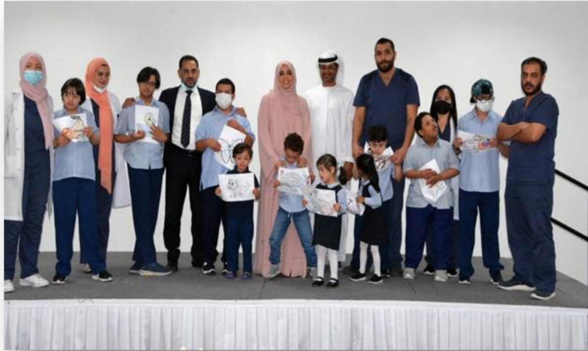
An educational session on Animals Welfare