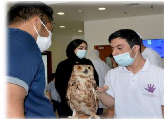
An educational entertainment activity in cooperation with Dubai Safari Park