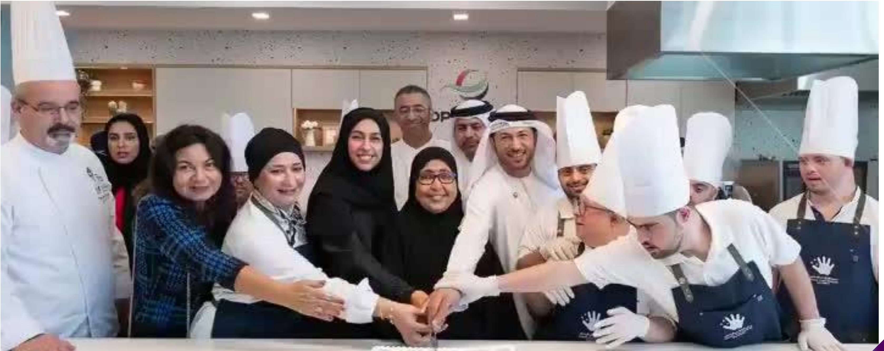
Opening of the Creative Kitchen for people with Down Syndrome